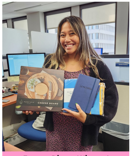
Easter Bingo Winner!